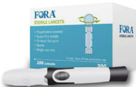
Lancing Device and Lancets